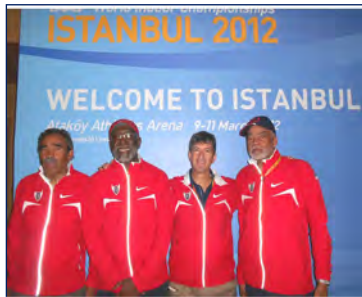
World Champs Team USA Coaching Staff