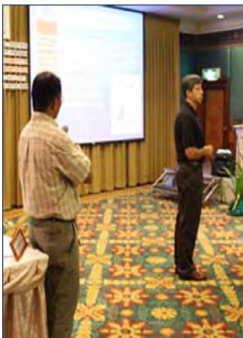
teaching sport management in Thailand