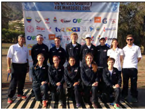
USA Pan American Cross Country team