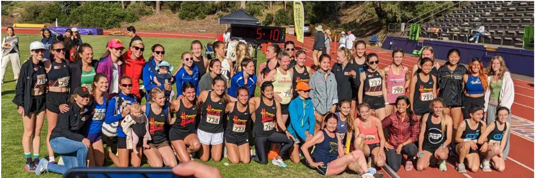
42 of the 100 team members

Average pace = 5:35 a mile. It was achieved by the Nike San Francisco Women's Miler Club, at San Francisco State University's Cox Stadium, on 3 June 2023. 100 different women each ran a 1-mile, passing a baton. These women ranged in age from 13 to 63, including a 5-month pregnant runner, and represented over a dozen local running clubs and seven city high schools. .