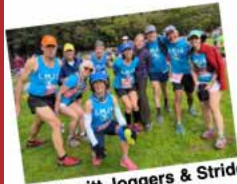
Lake Merritt Joggers & Striders