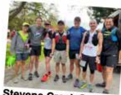
Stevens Creek Striders