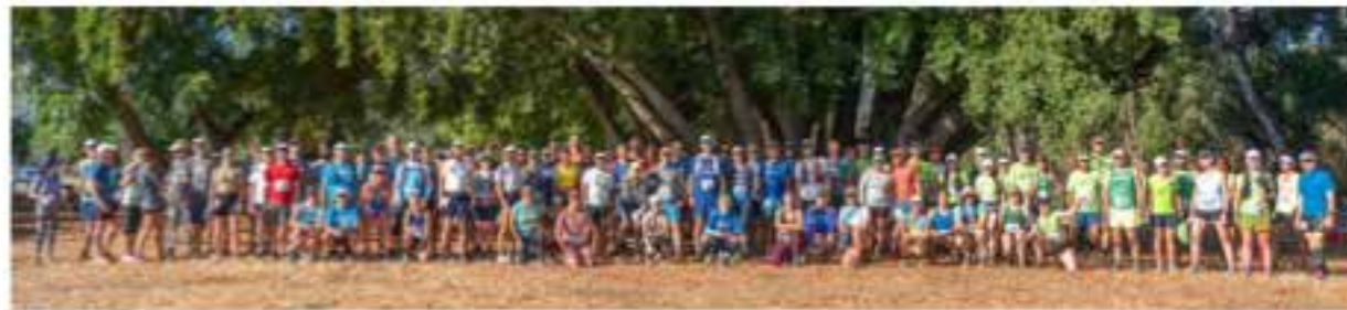
Start of Stevens Creek Reservoir Trail Half