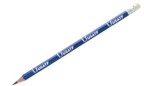
PENCILS PRICE: $83.38 / QTY:250