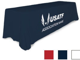
6' DRAPE TABLE CLOTH PRICE: $389.85