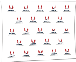
8' POP-UP BACKDROP PRICE: $1,017.98