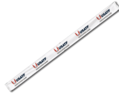
20' X 8" FINISH LINE TAPE PRICE: $63.25