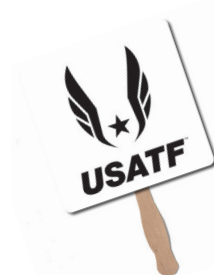
8" SQUARE HAND FANS PRICE: $138.58 / QTY:250