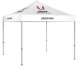
10' X 10' POP-UP TENT PRICE: $1,132.75

PLEASE COMPLETE THE FORM NO LATER THAN APRIL 1, 2022.