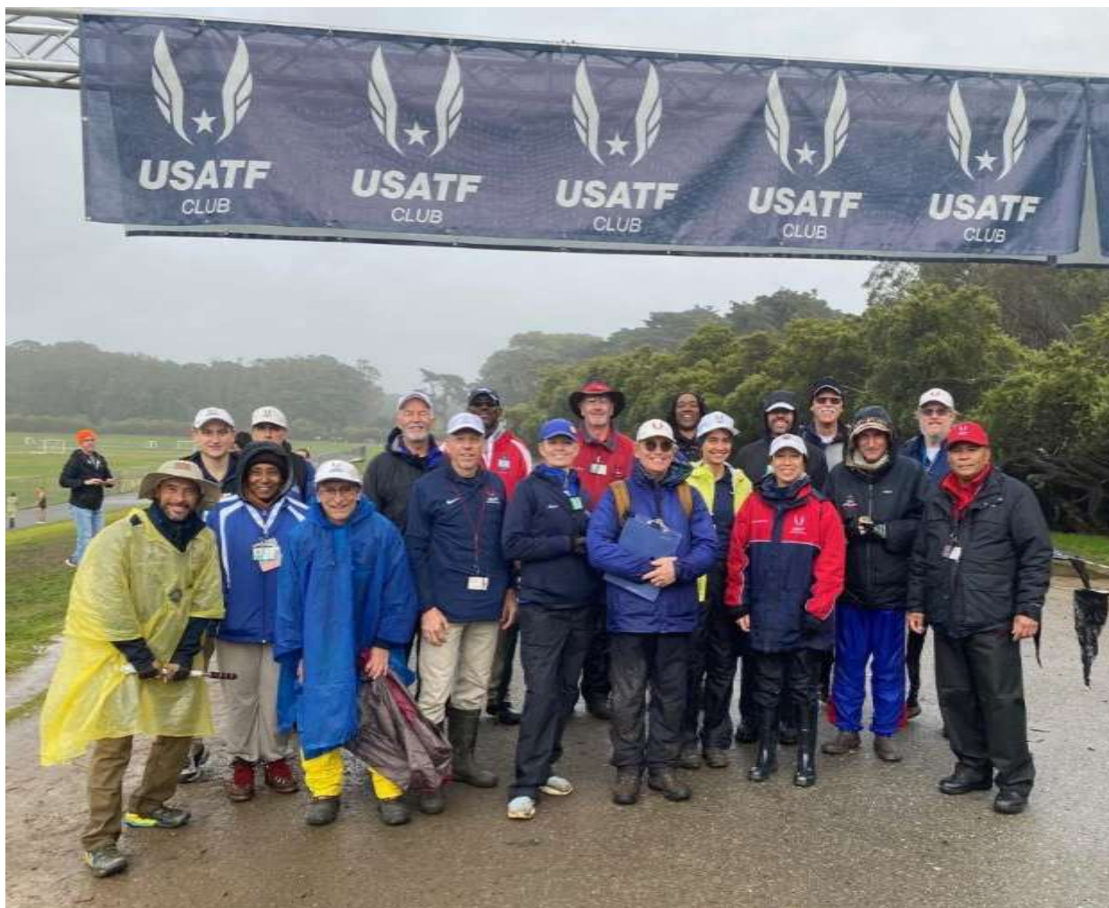
2022 USATF CLUB CROSS COUNTRY NATIONAL MEET AT GOLDEN GATE PARK