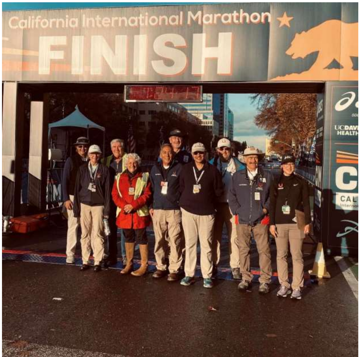
2022 USATF Marathon Championship at the California International Marathon, Sacramento CA 12/4/22.