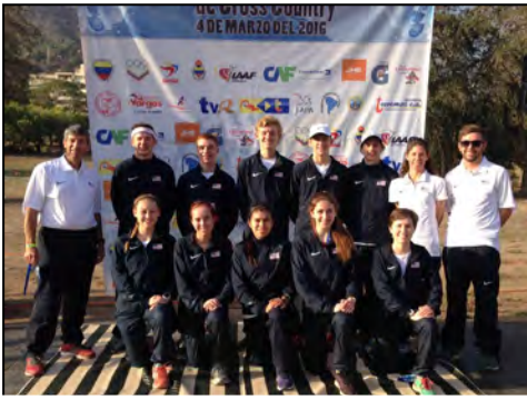
USA Pan American Cross Country team