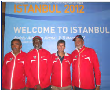
World Champs Team USA Coaching Staff