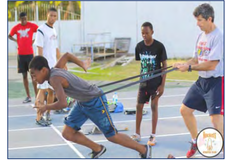
acceleration work at St. Lucia national clinic