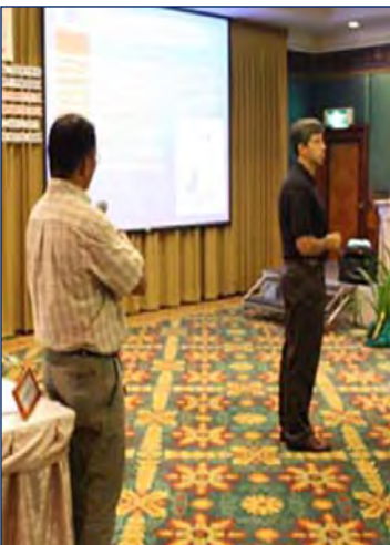
teaching sport management in Thailand