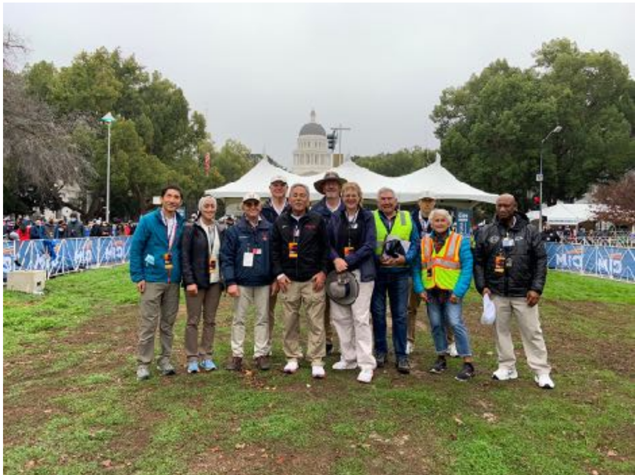
2021 CIM Finish Line Crew)

FOR WA Paralympic Rules https://www.paralympic.org/athletics/rules