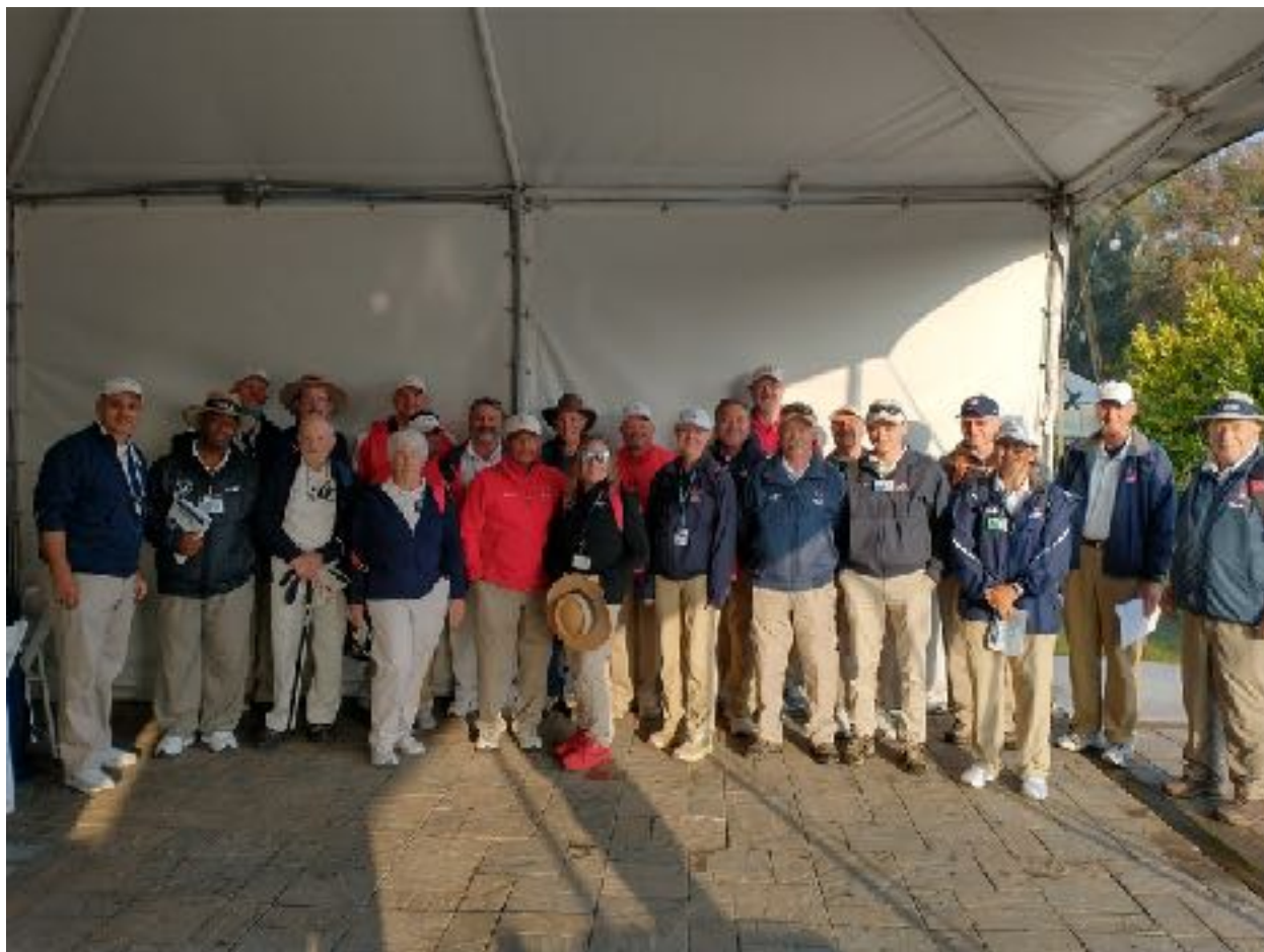
2021 DII West Regional X-C Championships Crew