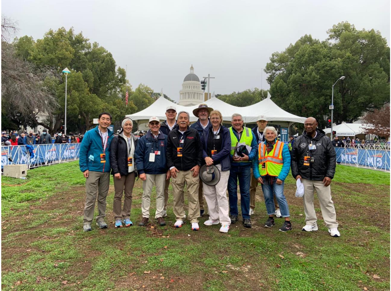
2021 CIM Finish Line Crew (I'll be with you next time)