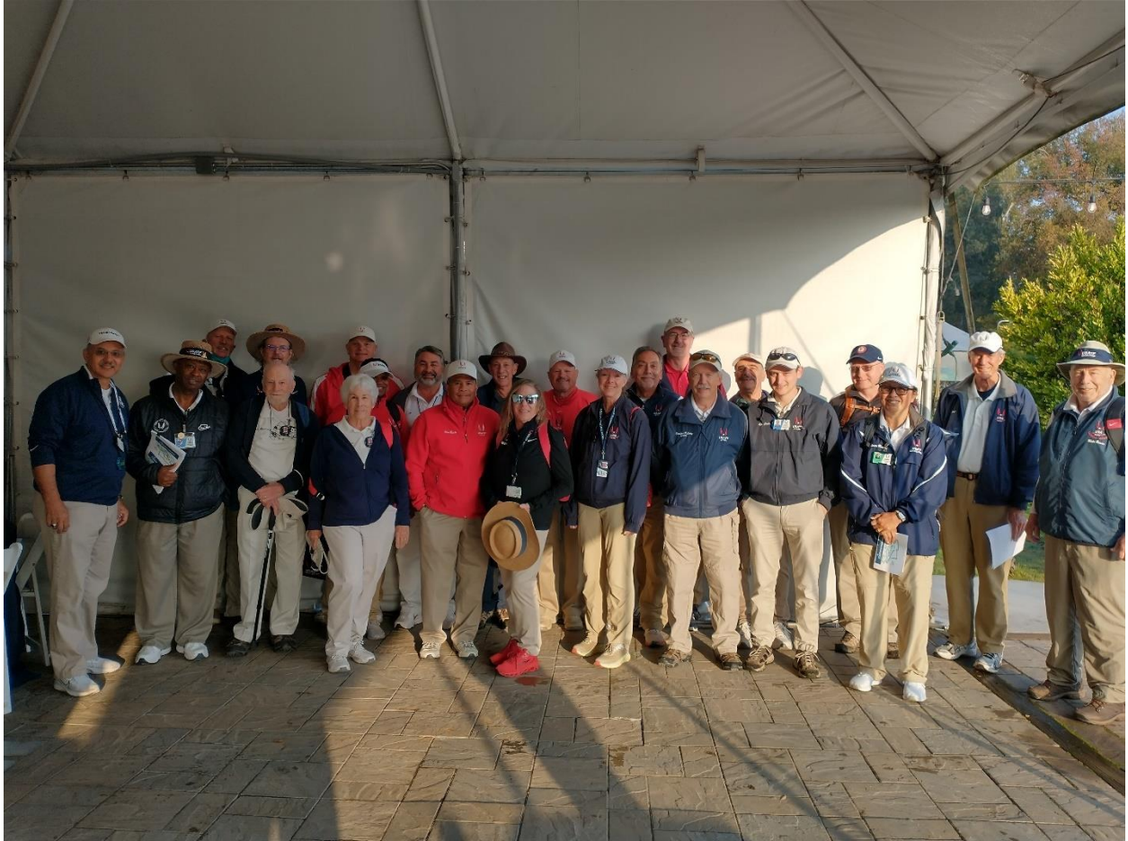
2021 DII West Regional X-C Championships Crew