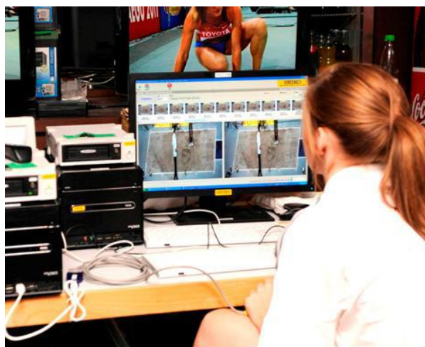
This is the view that the VDM operator.