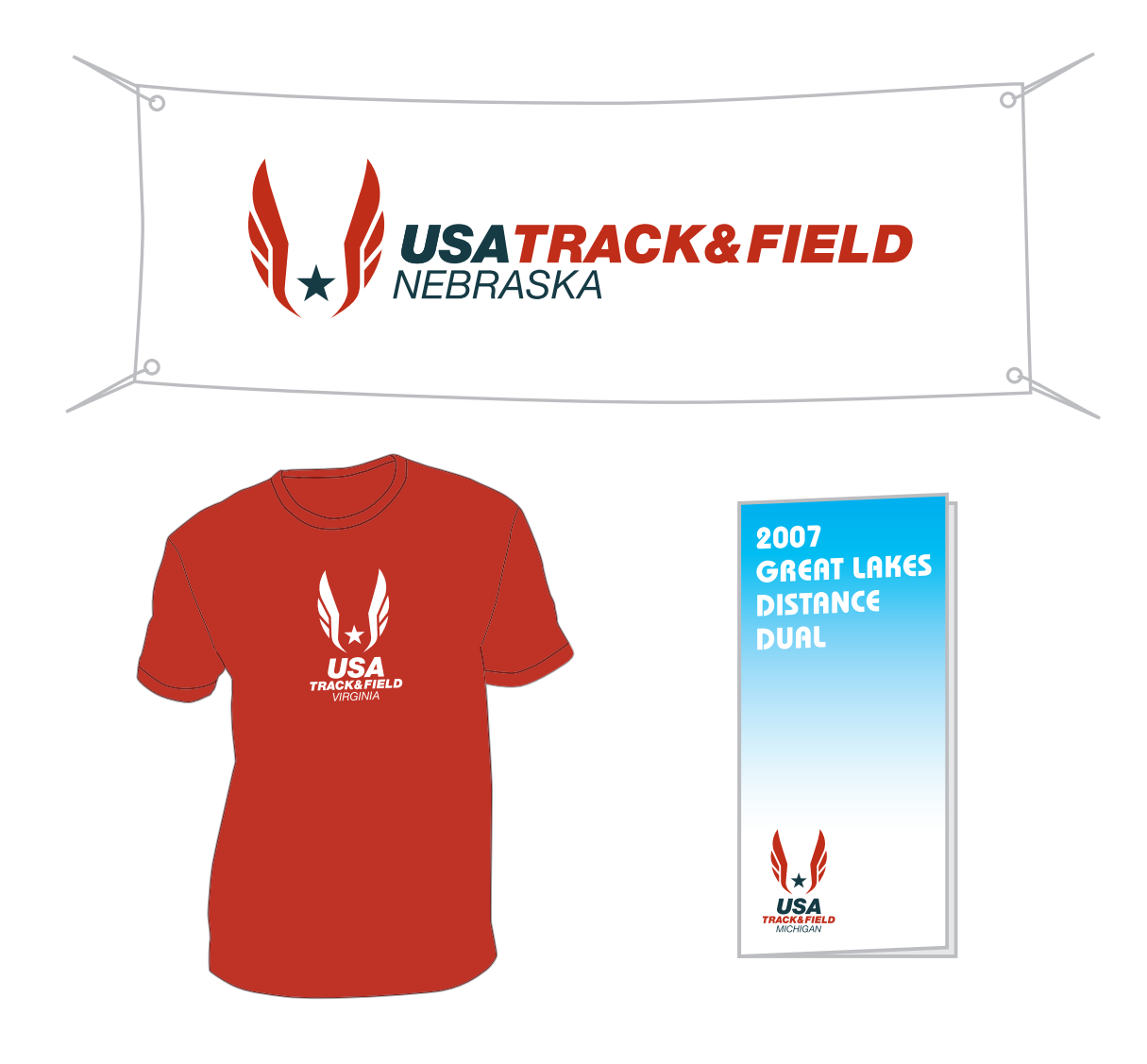
Examples of how to apply the branding