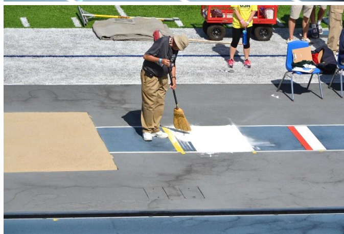
Charlie Sheppard carefully adjusts the chalk which makes up the jump board for the T9 athletes.

Jim Hume reports the view from the press box.