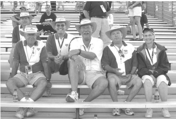
The “ Gang from Redding ” was caught watching the competition at the NCAA meet.