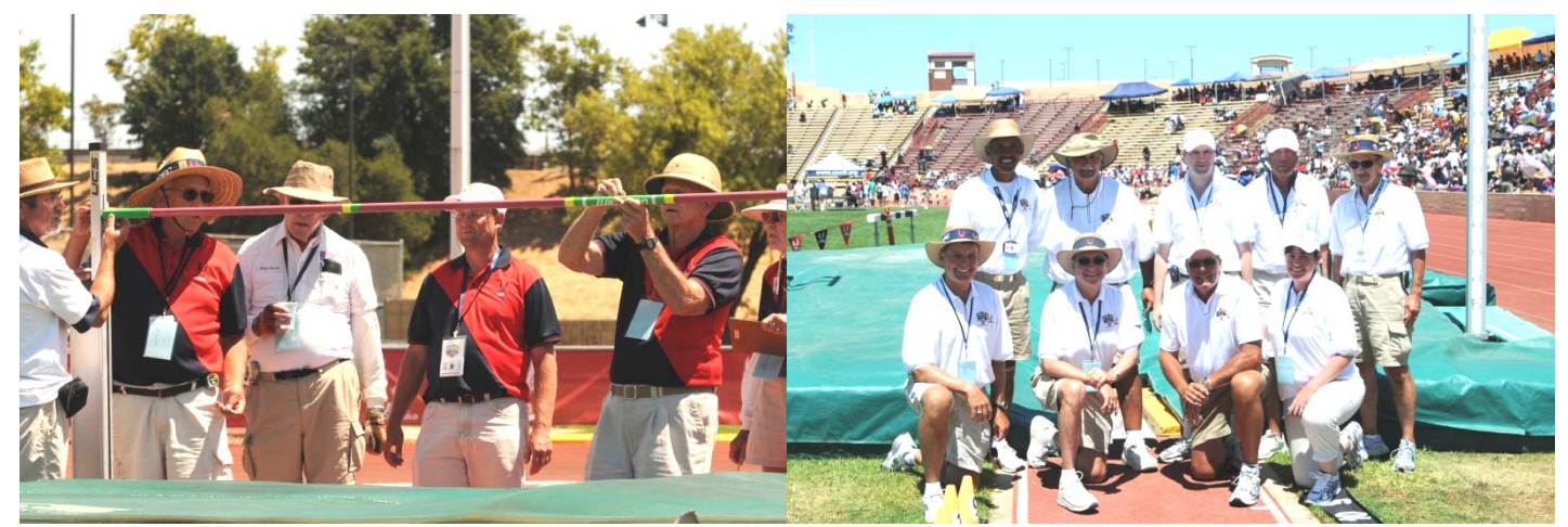
When you set up the high jump...mark the top of the bar.

During the National Junior Olympic Meet in Sacramento...there were people taking pictures of officials. Here is a random sample.