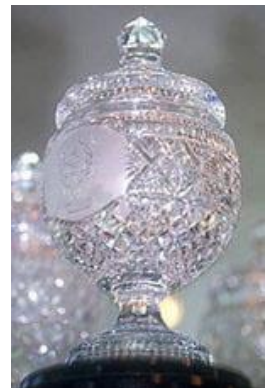
The Directors' Cup

About Learfield Sports: The 2010-11 athletics season marks its third year as title partner of the Learfield Sports Directors' Cup. A preeminent leader in the collegiate sports marketplace for nearly 40 years, Learfield Sports manages the multimedia and sponsorship rights for more than 50 collegiate institutions, conferences and associations. The company also operates regional and statewide radio networks, having broadcast over 50,000 games and coaches' shows since it began working with flagship property Mizzou in 1975. These ever-expanding, collegiate relationships feature strategic sponsorship platforms that include stadium/arena signage, official university publications, Internet sites, digital media, hospitality, radio and television programming as well as game-day events. To learn more about Learfield Sports, which is an operating unit of Learfield Communications, Inc., visit learfieldsports.com .