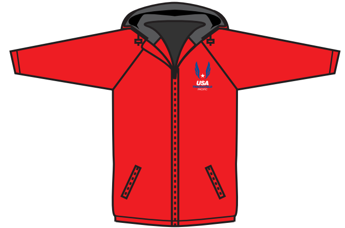
AUGUSTA (NEW STYLE LONGER THAN 5680) 5693 - HOODED TASLAN JACKET/QUILT LINED

S-XL: $63 INCL. NAME ON RIGHT CHEST 2X-4X AVAILABLE AT ADDITIONAL COST