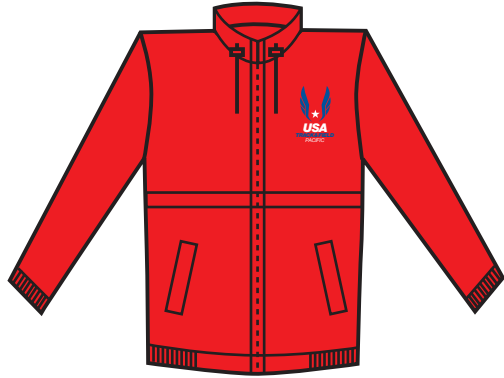
PORT AUTHORITY (OLD STYLE) J753 - CLASSIC POPLIN JACKET