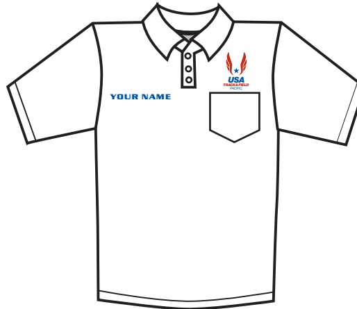
PORT AUTHORITY K420P - PIQUE KNIT POLO (UNISEX)

FLEXFIT® - SM-MED= 6"3/4 - 7"1/4 L-XL= 7"1/8 - 7"5/8 $20 NISSIN - ONE SIZE FITS MOST $15