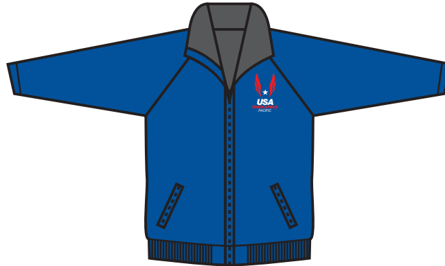
AUGUSTA (NEW STYLE) 5680 - TASLAN STORM JACKET/CHILL FLEECE LINED

XS-XL: $53 INCL. NAME ON RIGHT CHEST 2X-5X AVAILABLE AT ADDITIONAL COST