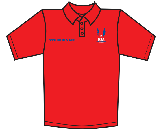
AUGUSTA 5095 - MENS WICKING MESH POLO AUGUSTA 5097 - LADIES WICKING MESH POLO

XS-XL: $35 INCL. NAME ON RIGHT CHEST 2X-6X AVAILABLE AT ADDITIONAL COST